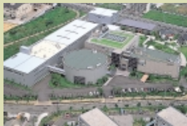
Daiwa House Industry's Central Research Laboratory consists of the Main Building, the Techno Laboratory and the Experimental House.

As a corporate member of society, Daiwa House's objective is to make a valuable contribution to social goals on both the local and national levels. For this purpose, we are making constant efforts to play a valuable role in social life via scientific and cultural activities concerning the living environment for the next generation, by such means as holding seminars open to the general public, mainly at the Company's Central Research Laboratory and Life Research Center.