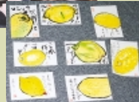
Many people attended an open seminar on picture postcards.