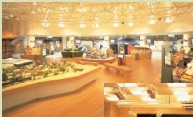
The Information Library at Daiwa House Industry's Central Research Laboratory stores specialized books and videos on construction and homes

The Life Research Center conducts a wide variety of surveys into matters relating to homes and lifestyles, and communicates the results of its research