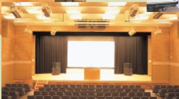
A laboratory introduction video is shown at the Community Hall at Daiwa House Industry's Central Research Laboratory.

As a corporate member of society, Daiwa House's objective is to make a valuable contribution to social goals on both the local and national levels. For this purpose, we are making constant efforts to play a valuable role in social life via scientific and cultural activities concerning the living environment for the next generation, by such means as holding seminars open to the general public, mainly at the Company's Central Research Laboratory and Life Research Center.