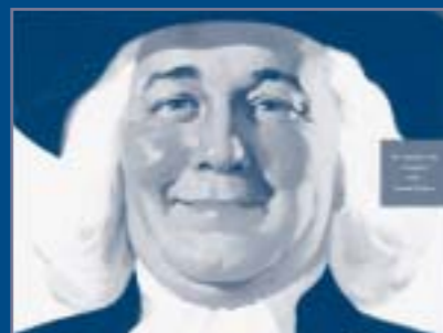
#1 1997 QUAKER OATS (U.S.)

© Copyright 2003 enterprise.com/Corporate Essentials.