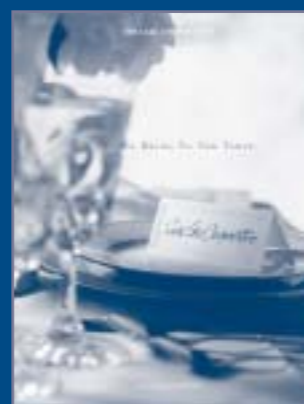
#1 1998 SARA LEE (U.S.)