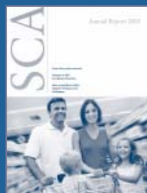
#1 2003 SCA (SWEDEN)