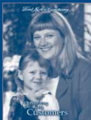
#1 2000 FORD MOTOR (U.S.)