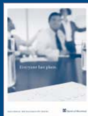
#1 2002 BANK OF MONTREAL (CANADA)