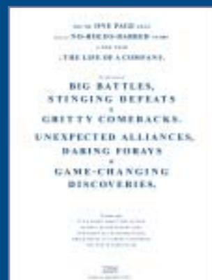
#1 2001 IBM (U.S.)