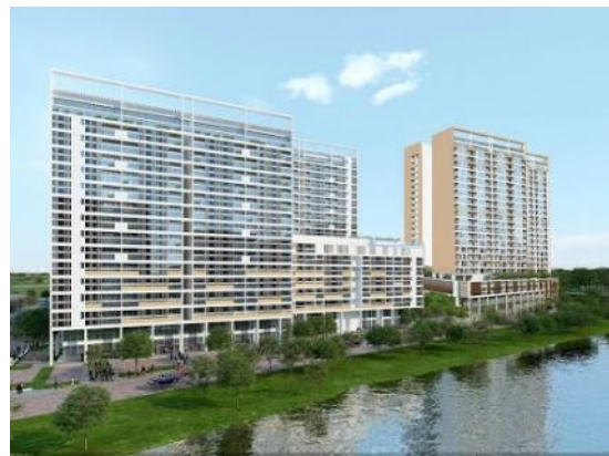
Phase 1 Completion Concept Image