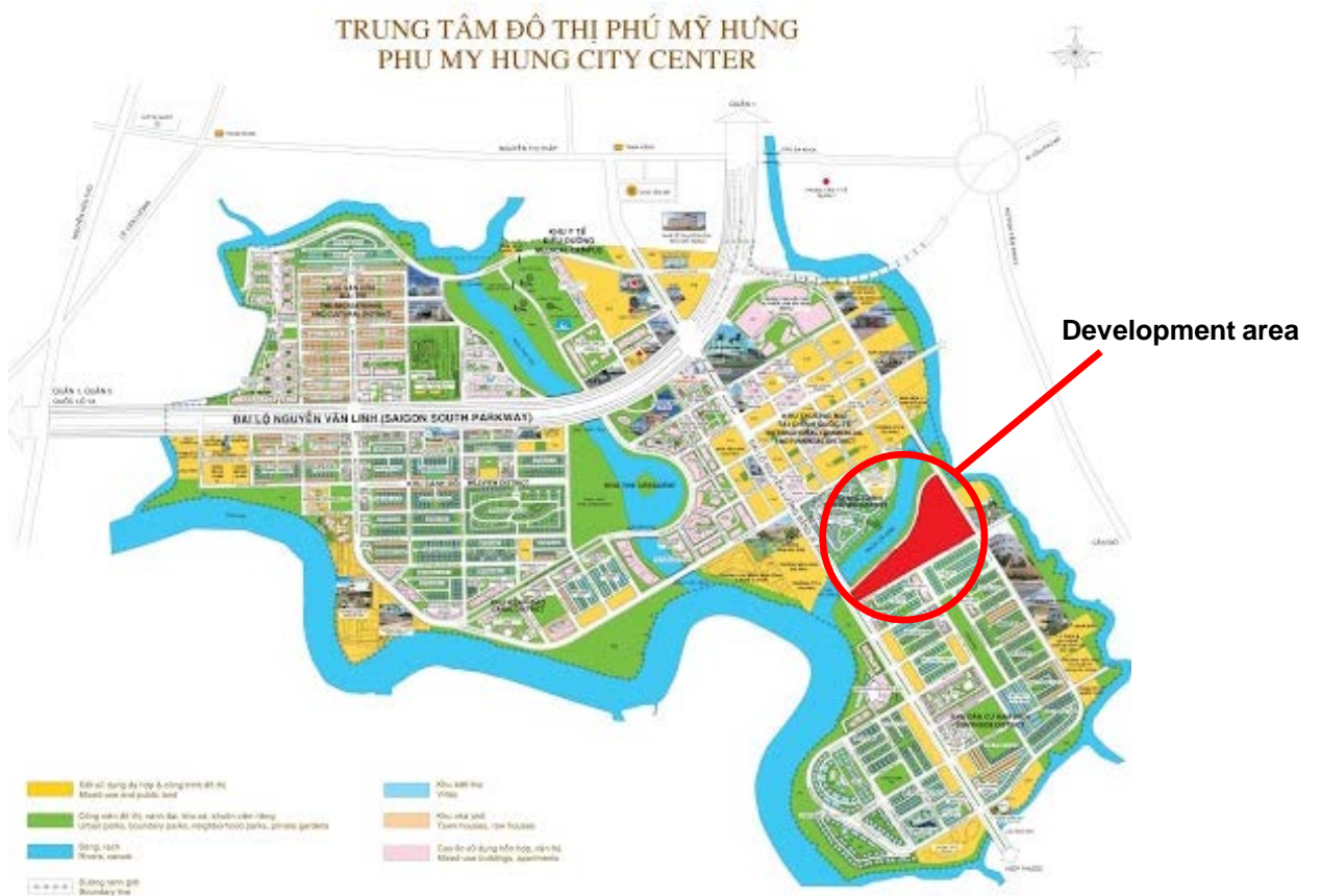
Phu My Hung area map