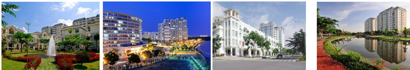
Phu My Hung area