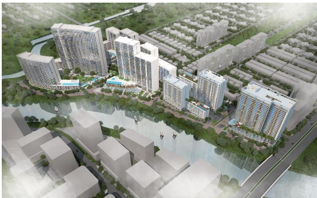
[Completed Concept (including Phase 1)]

Sumitomo Forestry Co., Ltd., Corporate Communications, Ohnishi: +81-3-3214-2270