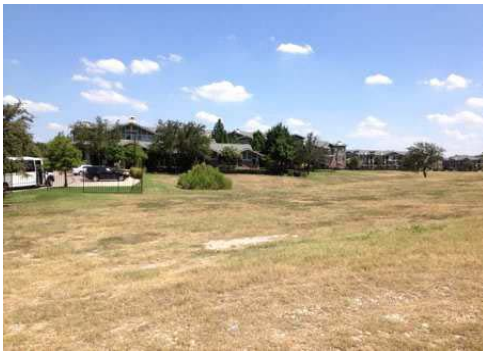
Prior to construction