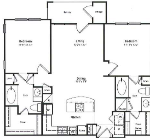
Berkeley I at present